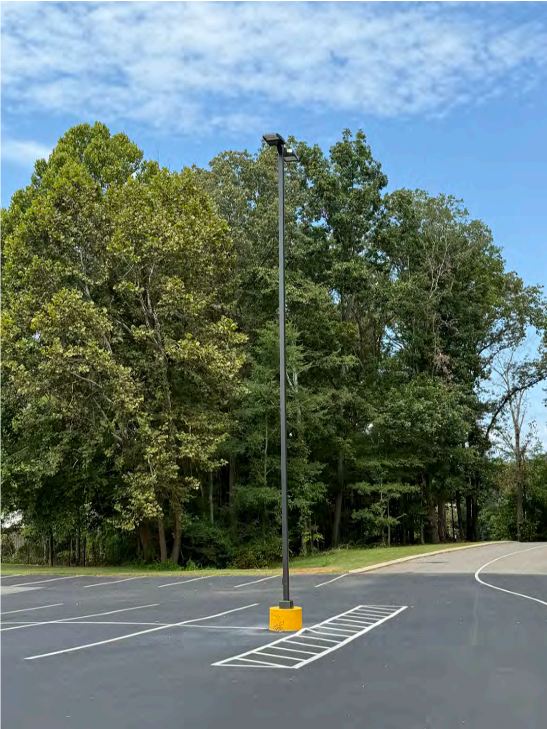
Sample light pole from Mars Hill's Early Education Building