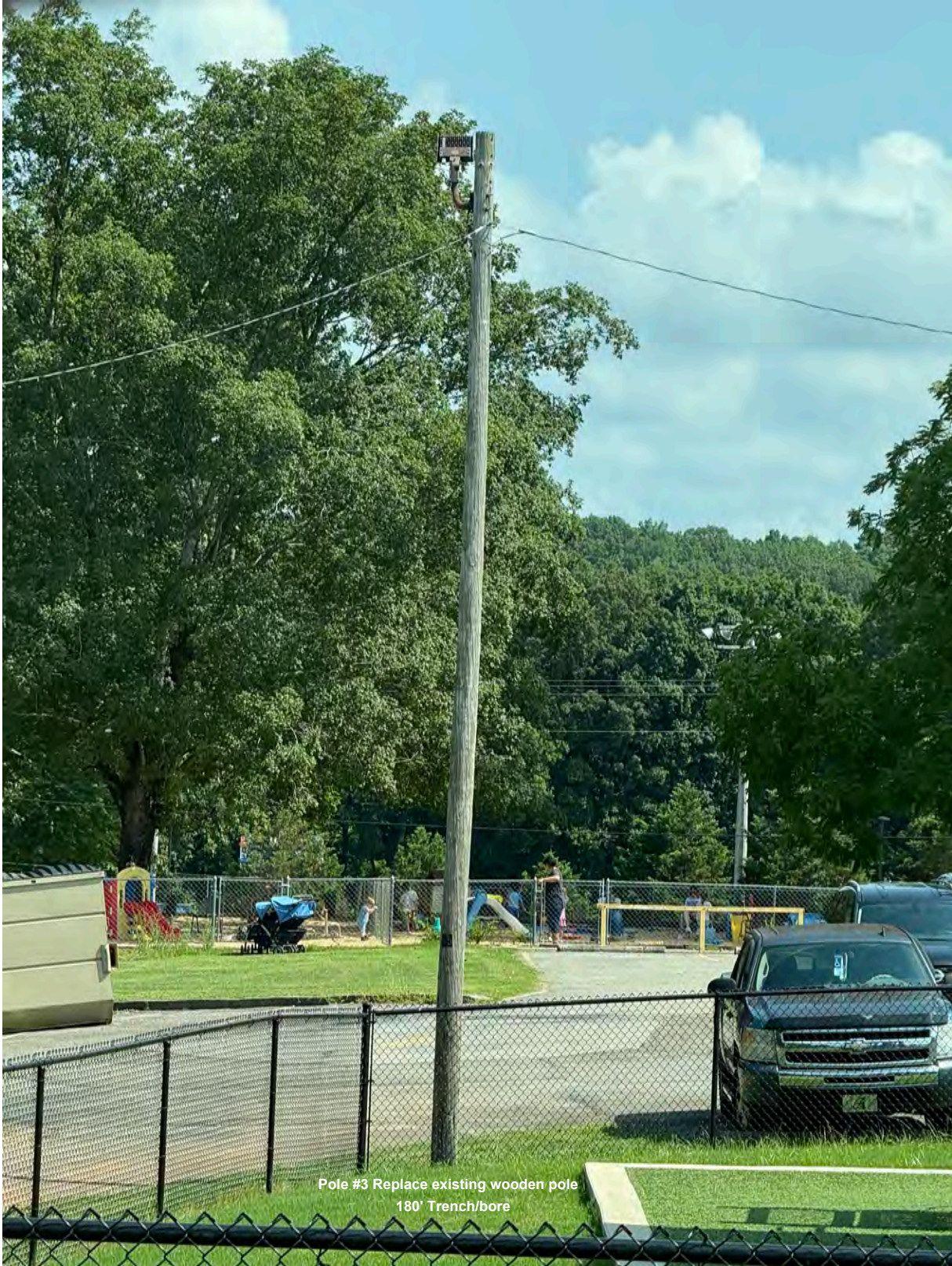
Pole #3 Replace existing wooden pole 180' Trench/bore