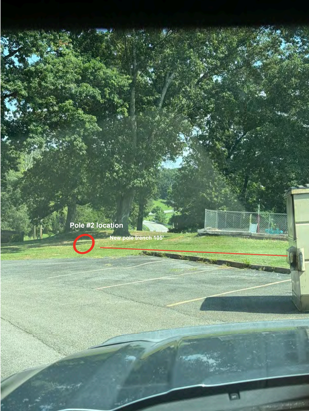
Light pole 2, location