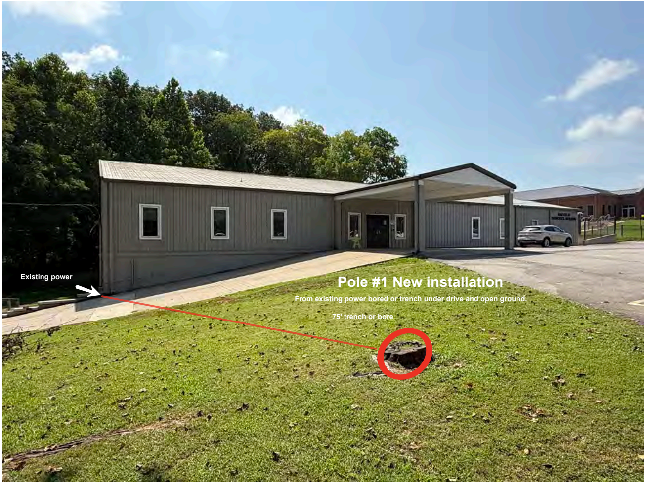
Light pole 1, location