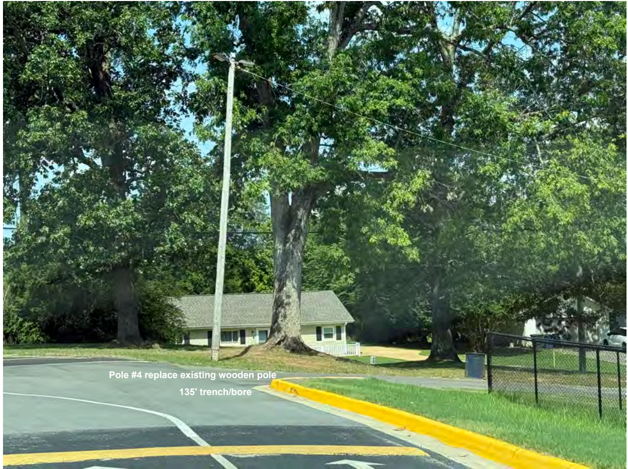
Light Pole 4, location